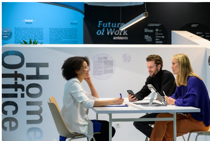
The focus was on the new theme of New Work in the Future of Work area of Ambiente.