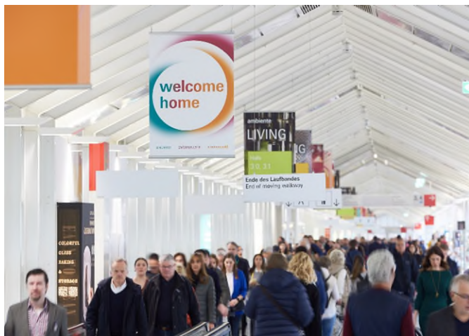
Great reunion joy in Frankfurt for Ambiente, Christmasworld and Creativeworld 2023.

Finally, discover product worlds with all your senses again and be inspired by innovations! More than ever, Frankfurt became the home of the global consumer goods market. For five days, the fully booked exhibition halls were buzzing with reunions and an energetic ordering mood. A total of 154,000 buyers came to Frankfurt to experience trends live and to order for their collections, with which they stimulate the consumer mood.